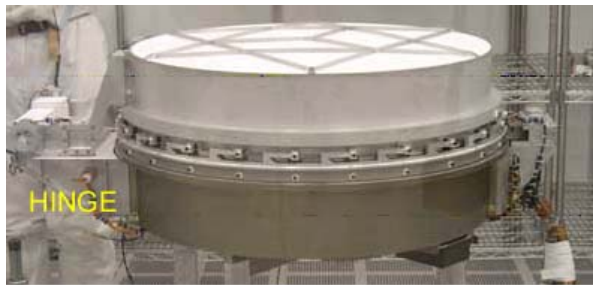
Fig. 1. Pre-flight configuration of the science canister.

Introduction: The Genesis science canister is an aluminum cylinder (75 cm diameter and 35 cm tall) hinged at the mid-line for opening (fig. 1). This canister was cleaned and assembled in an ISO level 4 (Class 10) cleanroom at Johnson Space Center (JSC) prior to launch. The clean solar collectors were installed and the canister closed in the cleanroom to preserve collector cleanliness. The canister remained closed until opened on station at Earth-Sun L1 for solar wind collection. At the conclusion of collection, the canister was again closed to preserve collector cleanliness during Earth return and re-entry. Upon impacting the dry Utah lakebed at 300 kph the science canister integrity was breached [1]. The canister was returned to JSC. The canister shell was briefly examined, imaged, gently cleaned of dust and packaged for storage in anticipation of future detailed examination. The condition of the science canister shell noted during this brief examination is presented here. The canister interior components were packaged and stored without imaging due to time constraints.