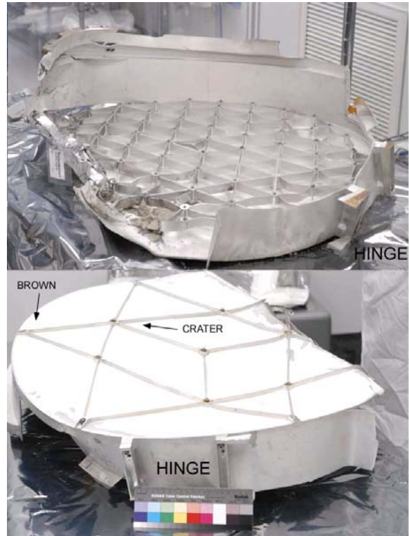
Fig. 3. Interior (upper) and exterior (lower) views of the science canister cover, as received at JSC. Arrows point to the location of the micrometeorite crater (fig. 4) and brown discoloration (fig. 5).

Micrometeorite impact: One crater, with morphology of typical micrometeorite impact craters, was observed. The crater, approximately 400 \mu m in diameter, is surrounded by a dark halo (fig. 4). The